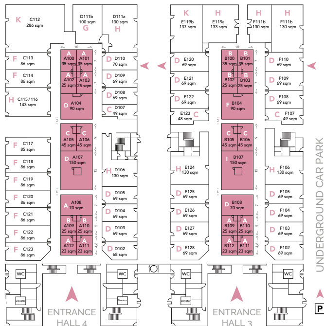
Atrium 4 (first floor)